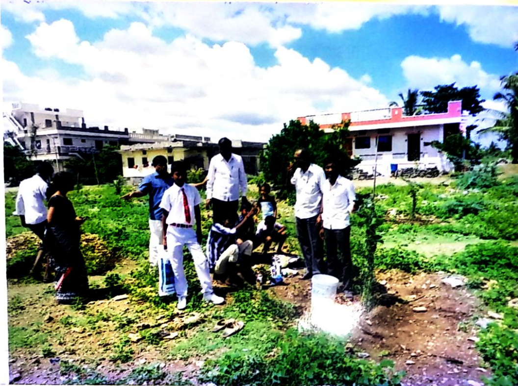
National Disaster Management Training (NDMF)